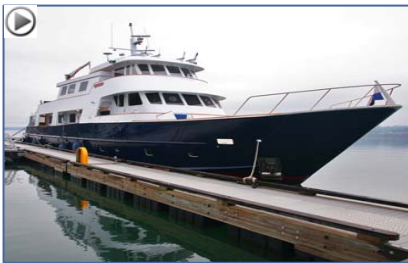
M/Y KAYANA – 120' 6+ staterooms 4 kayaks, 3 dining areas, dining for 14, hot tub, media center