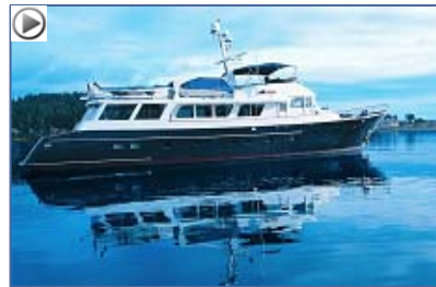
M/Y KATANIA – 100' 3+ staterooms 4 kayaks, 3 dining areas, hot tub, fishing gear/live bait well

"We had an absolutely enchanted time aboard the Katania. A more beautiful yacht does not exist."